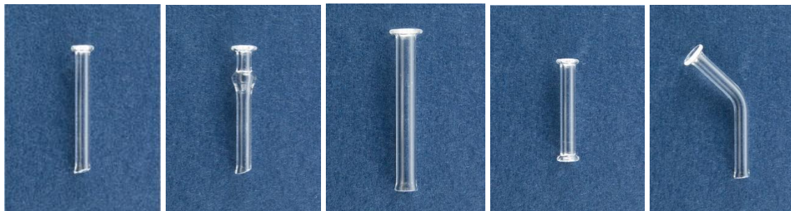
Lester Jones Tube

The type, size, angle of the Implantable tube depends on the anatomy of the patient and is determined prior to the surgery by the consultant surgeon after an evaluation of the patient's lacrimal sac. The following product variants can be available in different sizes, angles, frosted, as deemed suitable by the surgeon for the respective patient. (For full list of available sizes and variants please visit www.altomed.com ).