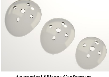
Anatomical Silicone Conformers – Large, Medium, and Small