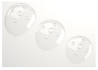
Anatomical PMMA Conformers – Large, Medium, and Small