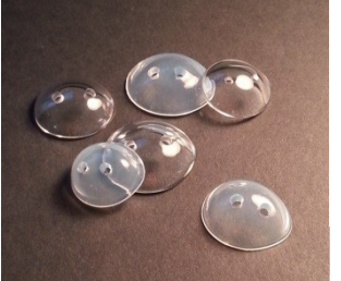
Silicone - Soft / Cloudy Finish PMMA - Hard / Clear Finish